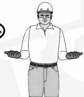
EXTEND BOOM EXTIENDA EL BRAZO