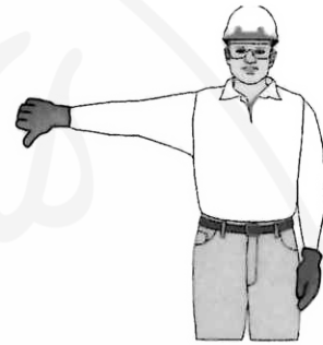
LOWER BOOM BRAZO INFERIOR