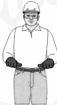
RETRACT BOOM REPLIEGUE EL BRAZO