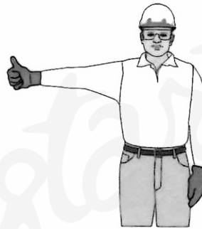
RAISE BOOM SUBA EL BRAZO